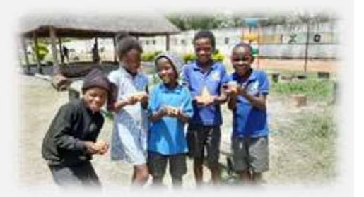
Making shapes with clay soil to help learn the names and features of 3D shapes

It is clear whenever you enter this Grade 2 class that they love school, they love learning and they love their teacher. Every lesson has practical resources to make or feel with things to do every few minutes so there is no opportunity to switch off or get bored. The children have been leaning some very technical vocabulary and understanding concepts in maths and science that we wouldn't expect them to grasp until next year. We hope their passion for discovery continues through every grade until this class finish learning at Kapumpe.