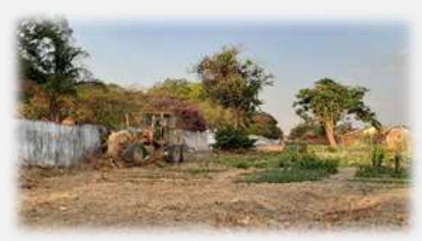
Clearing grass and levelling the ground