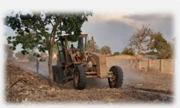
The mighty grader at work

As usual, life at Kapumpe has been very exciting this term, bursting with change, development and creativity. We began term 3 making plans