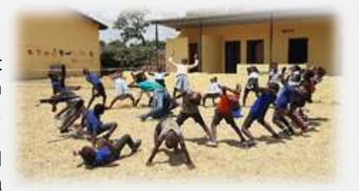
Stretching beyond limits in PE. Teacher leading by example whatever the lesson.

Buildings' was the favourite topic this term with the pupils learning not only about different types of buildings but the different ways buildings can be made and the different people and jobs that are involved in building. Some are now thinking about being an architect when they grow up. It has been wonderful to see the energy in this class has not dwindled through the year. Even their final performance on the last day of term, a piece of performance poetry about the world changing and the need for good role models, demonstrated their energy and passion for life.