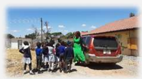
Learning about transport using real objects – the Head's car