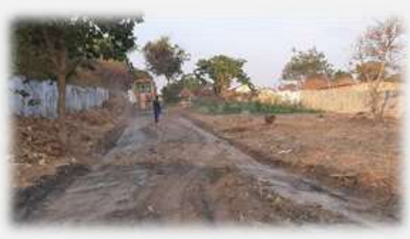
Ready for laterite and shaping